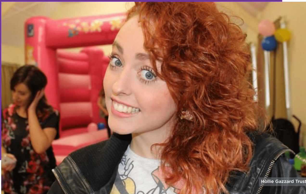
Hollie Gazzard Trust