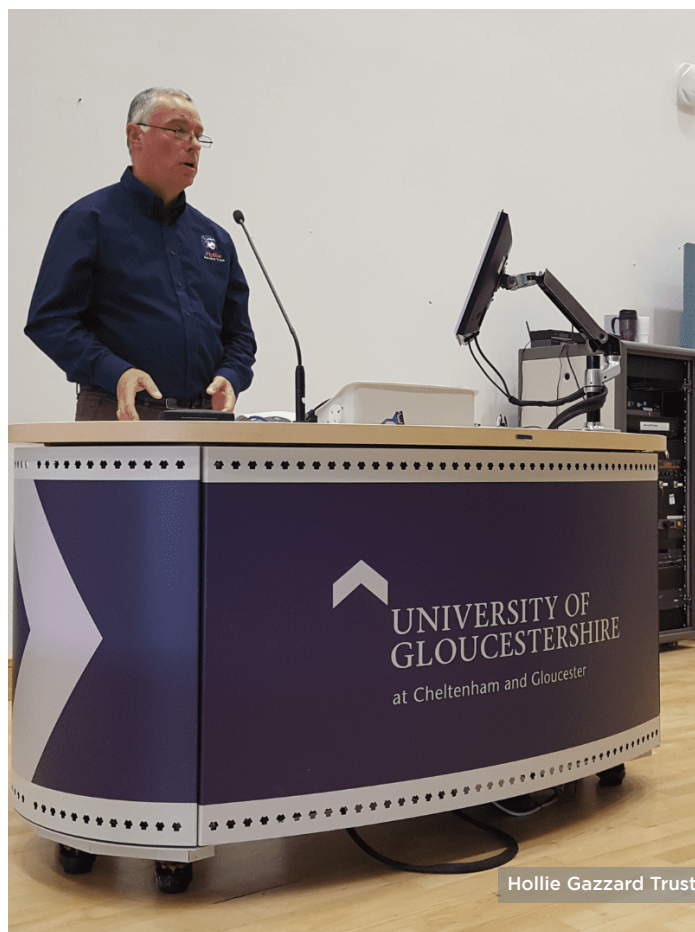
Hollie Gazzard Trust

It meets the criteria of the programme by investing in the future of particularly young people for the benefit of the wider community in a very difficult field.